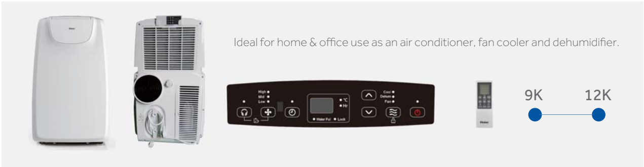
Ideal for home & office use as an air conditioner, fan cooler and dehumidifier.